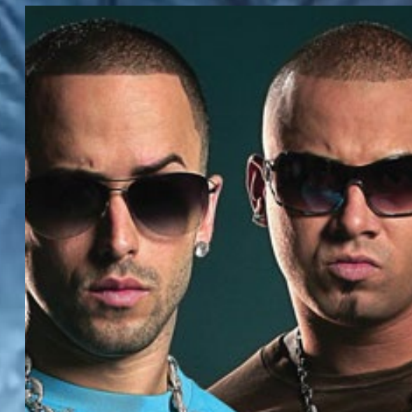
WISIN Y YANDEL